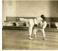
Dai san kyo: Harai goshi