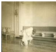
Se oi otoshi