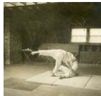
Dai i kyo: Tai otoshi