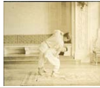
Uchi mata (rotation [arrow])