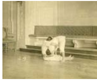
Dai go kyo: Uchi maki komi