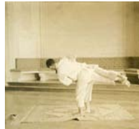
Tomoe nage (a)