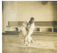
Uki maza (b)