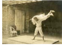
Dai roku kyo: Giyaku maki komi (a)