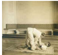
Tomoe nage (b)