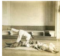
Yoko gake [photo loose, laid into album]