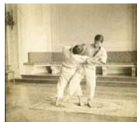
Da ashi harai