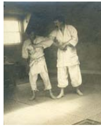
Giyaku maki komi (b)