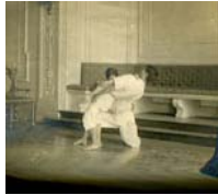
Dai shi kyo: Utsuri goshi