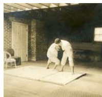
Dai i kyo: Tai otoshi