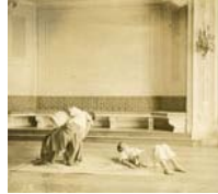
Uki maza (a)