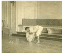
Dai san kyo: Obi otoshi