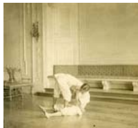
Se oi otoshi