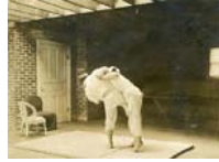
Dai shi kyo: Kata guruma