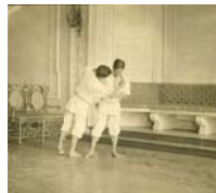
Dai hi kyo: O goshi